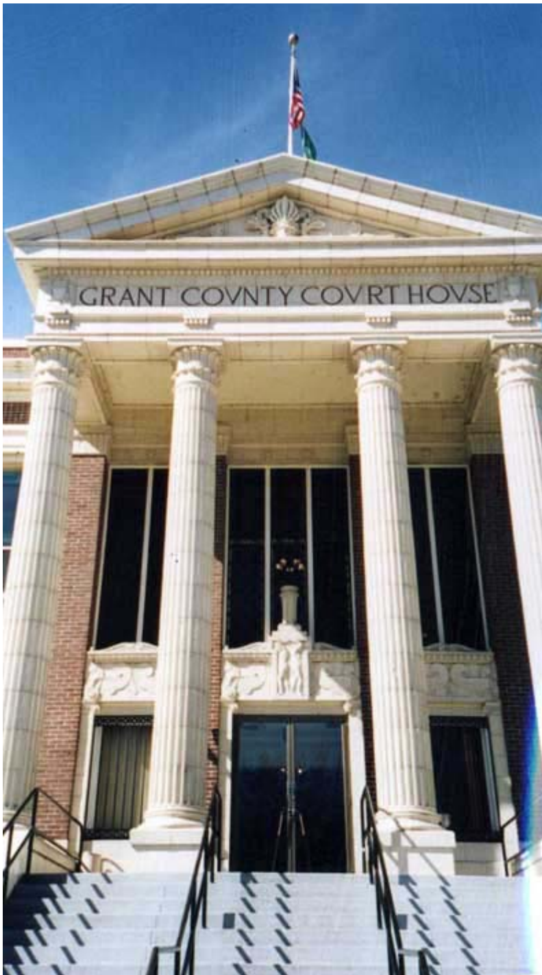
Ephrata is the seat of Grant County, hosting the County's courthouse as well as regional headquarters for federal agencies.