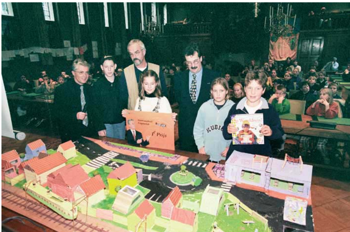
The prize winners at the children's contest on Groningen 2030 where children were asked to picture life, living and working in Groningen 2030. This was part of the first public campaign in 1998 when the province of Groningen started the "stand-up for the future of Groningen" in the POP process of developing a new plan for the area.