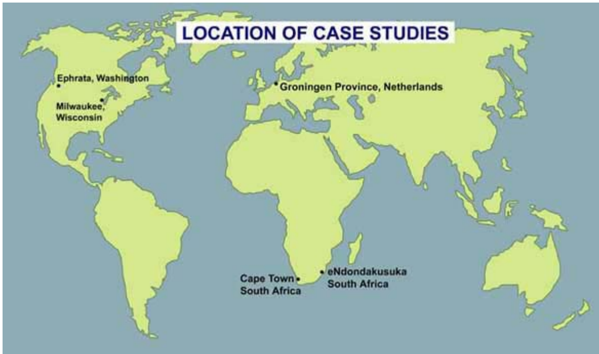
Agreeing and implementing an integrated regional plan - The 'POP' Plan, Groningen Province, Netherlands.